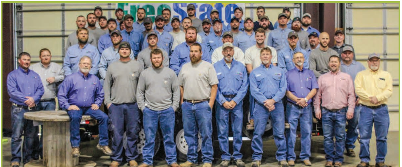
Lineman Appreciation Day April 13, 2020

Some people can light up your life. A rare few light up the world.