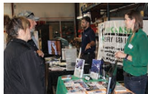
Members meet with Cromwell Solar representative to learn more about solar energy.

At the event, FreeState also collected an additional 410 pounds of soap donations for the last week of the Cooperative Soap Drive. All donations will be divided