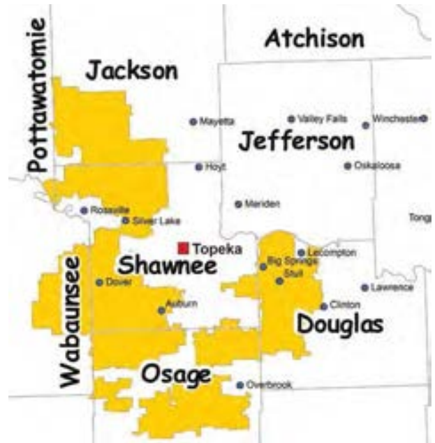
In 2016, terms for trustees from Districts 3, 6, and 9 will expire. To submit your name for nomination, please complete and return the form below by Jan. 22.

to serve on the nominating committee, and their duty is to select and nominate qualified candidates to be placed on the ballot. This committee will review the names that have been submitted and will then present a slate of nominees to be presented to the membership at the KVEC Annual Meeting for