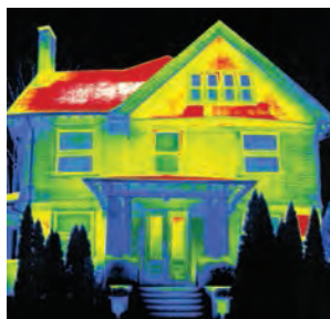
Infrared Thermography can be added to your home evaluation for $100 and captures air leakage pathways through thermal images.

We are pleased to announce another service offered through the cooperative that is aimed at saving you money on your electric bill. LJEC has partnered with Good Energy Solutions (GES) to offer home energy evaluations.